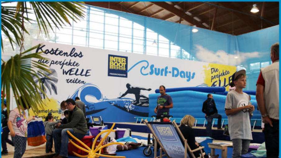
Interboot Messe Friedrichshafen