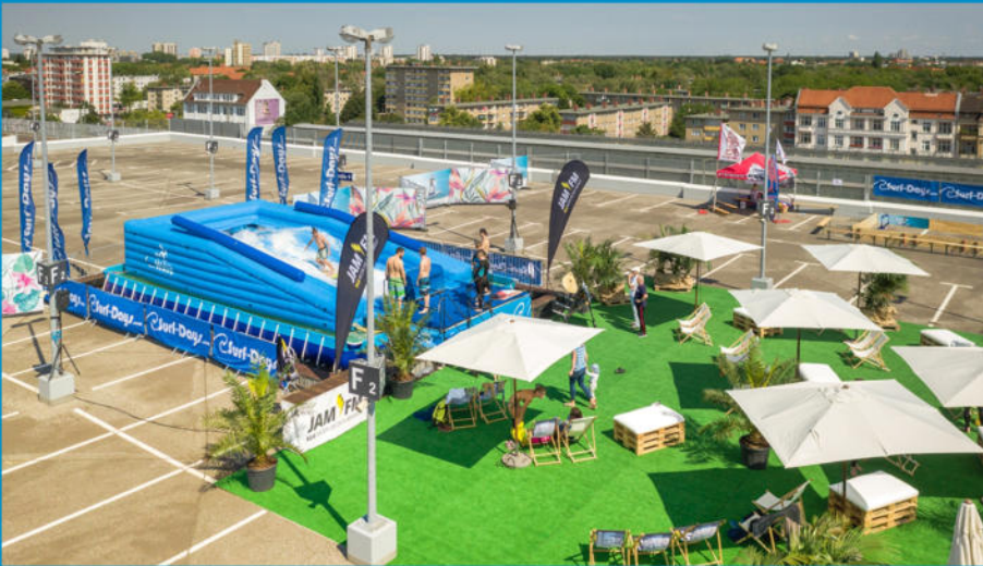
Parkdeck Spandau Arcaden Berlin