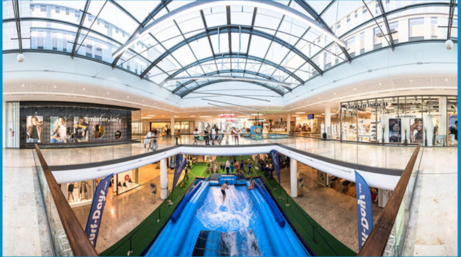
Glacis Galerie Neu-Ulm